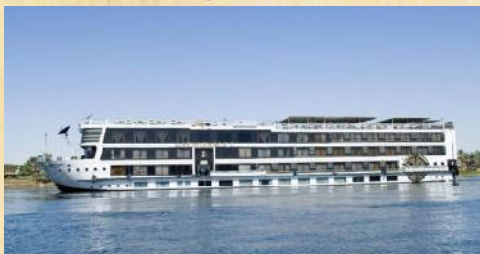
Nile Cruise to Nubia

Price includes taxes and fuel surcharges.