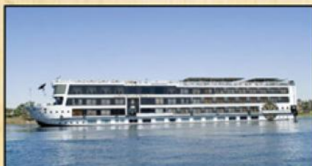
Nile Cruise to Nubia

Price includes taxes, fuel surcharges and visa fees.